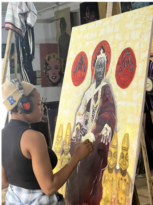
Painting by the Research.