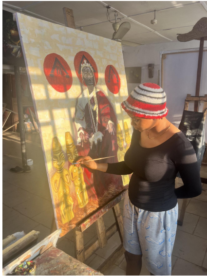
Painting by the Research.