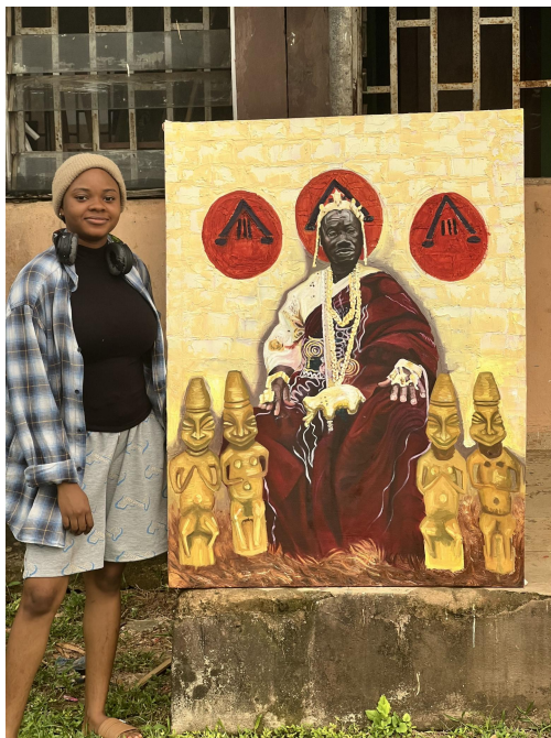
Painting by the Research.