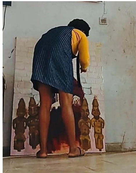
Painting by the Research.