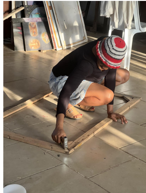
Construction of stretcher by the researcher

Construction of 4 by 3ft stretcher is been constructed to have the canvas on as surface for the painting.