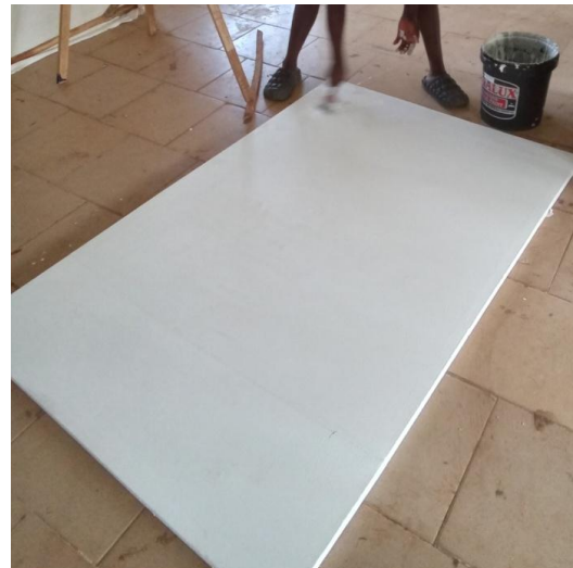
Priming of Canvas by Researcher.

A surface that prepares the ground is known as a "painting ground." There were two mechanisms at play: priming and sizing. Sizing is a mixture of top bond glue and water in a 2:1 ratio, or more glue and less water. Its main purpose is to seal the fabric's air pores,