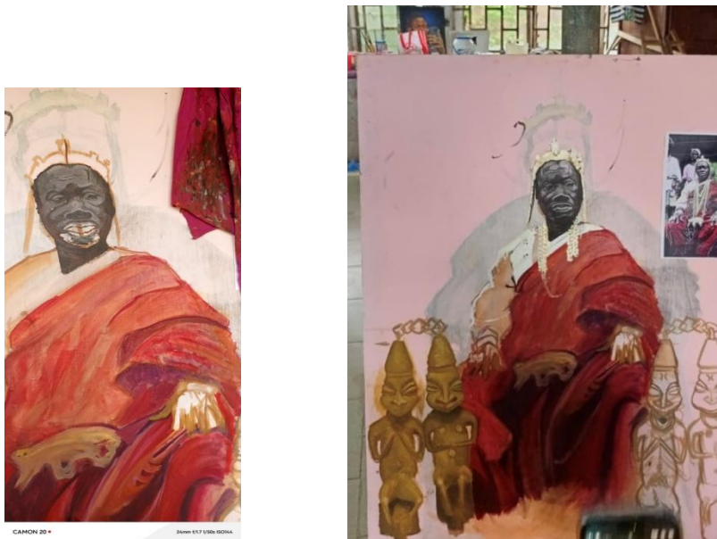
Painting by the Research.