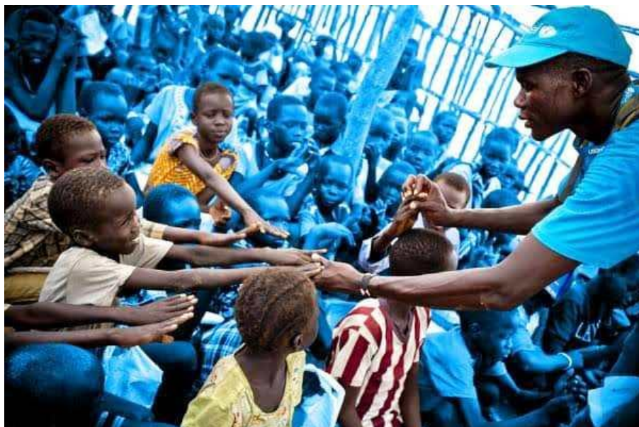
Source: The Sun Nigeria, 2022. Accessed February 15 th , February, 2025