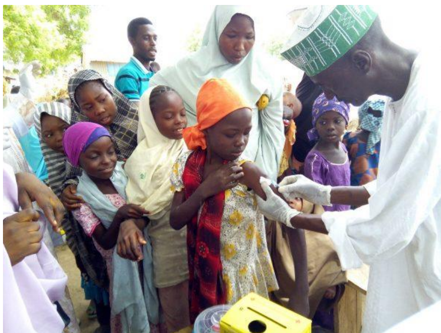
Unicefforeverychild.org Accessed February15th 2025.