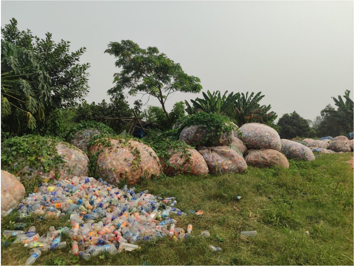
Figure 4:2: Collected and packaged plastic waste for recycling in Ekosodin

In contrast to organic waste disposal, field observations revealed informal plastic waste recycling practices within Ekosodin.