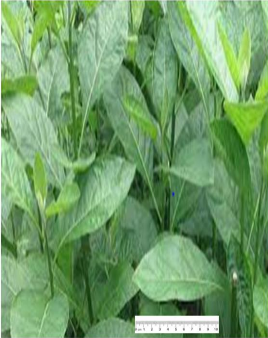
Plate 1.1: Vernonia amygdalina DEL