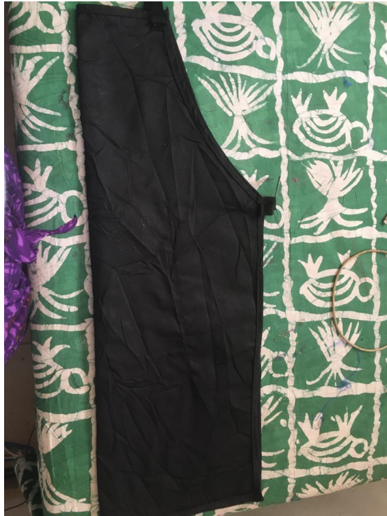
Plate 1 Fabric cutout of the apron