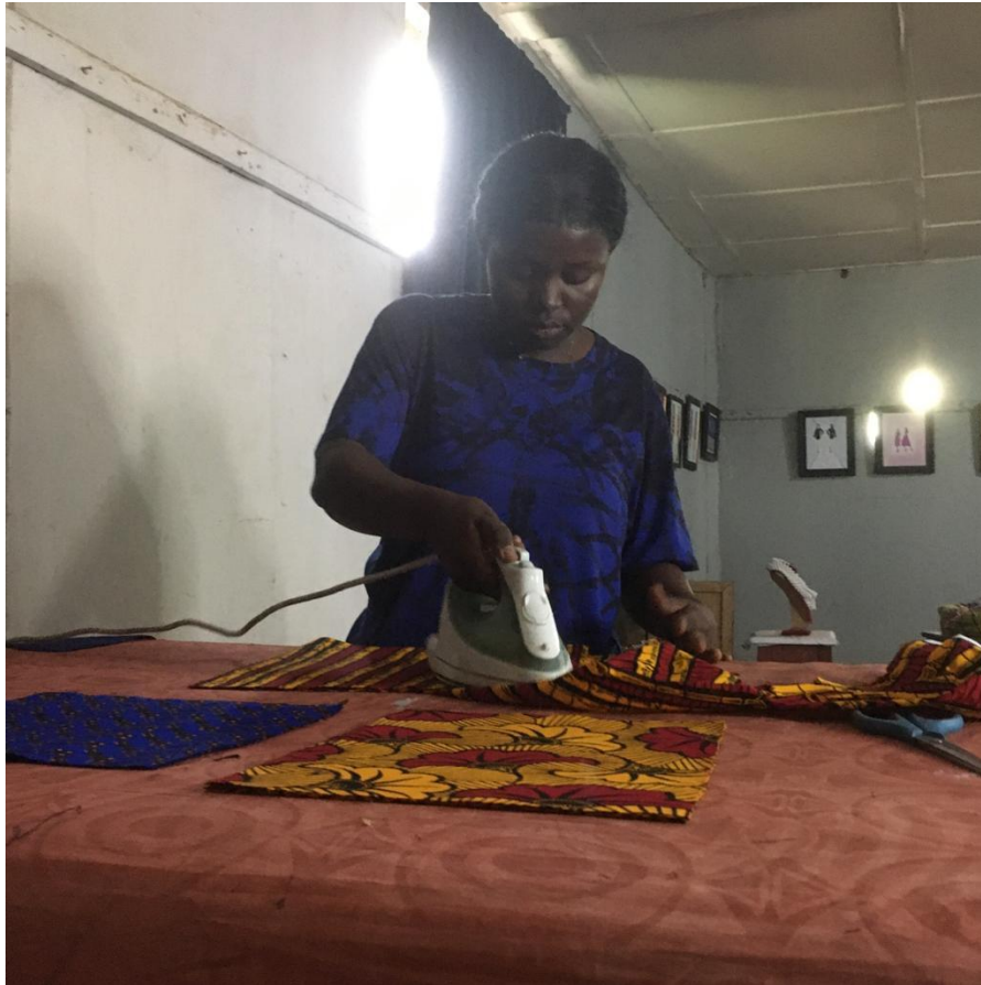
Plate 3: Ironing of the apron