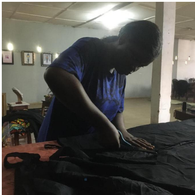
Plate 2: Sewing process of the apron