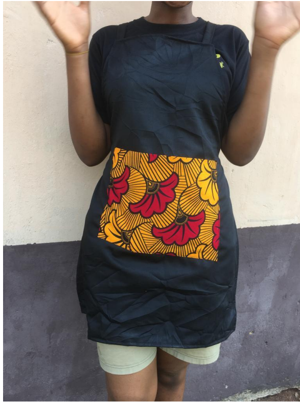
Plate 4: Model wearing the apron