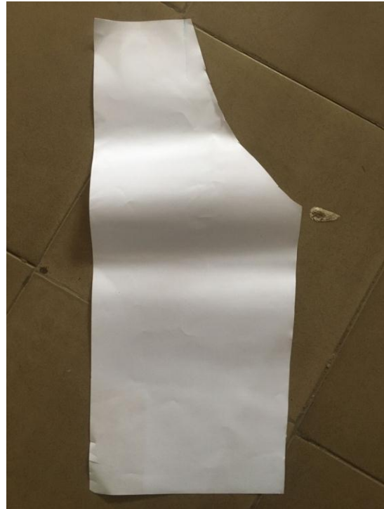
FIGURE 2: Pattern cutout of the apron