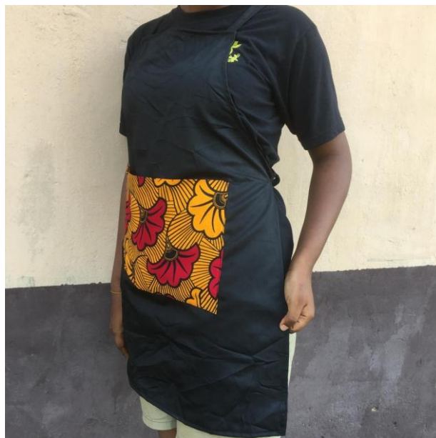
Plate 5: Model wearing the apron