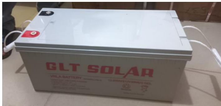
Fig. 3.2: 200Ah Solar Battery

Lead acid batteries come in two varieties: gel cells and sealed absorbent glass mats (AGM). AGM batteries have dominated the market because they don't need to be maintained, and they work especially well in grid-tied systems that need to be charged continuously. It is generally not recommended to overcharge gel-cell batteries, which are designed to survive freezing temperatures, as this can result in irreparable damage. The rated capacity of lead acid batteries are typically stated in terms of C/8, C/10, and /20 hour rates. While UPS batteries are rated for 8 hours, telecommunication batteries are rated for 1-0 hours, with 12VDC or 24VDC at 150Ah or 200Ah (Jiang et al., 2005).