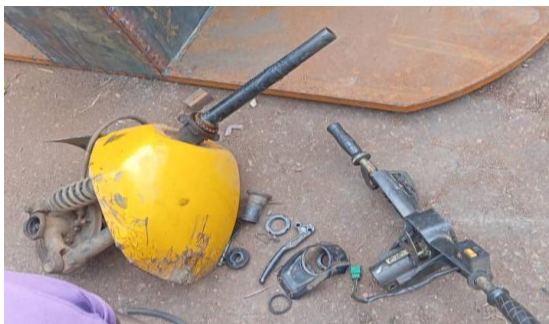
Fig. 2.2: Steering wheel

For increased safety, this solar three-wheeler's front and rear left wheels will both use regenerative braking. The brake is engaged using the hand lever that is connected to the handle and steering. Here, the steering will be provided by a standard handle bar that is coupled to the front wheel and embellished with switches, brake levers, and accelerators, among other things.