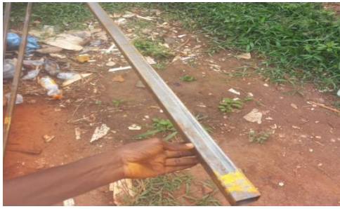
Fig. 3.3: Mild steel