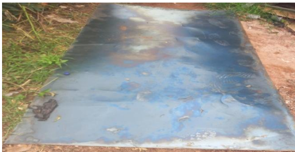
Fig. 3.4: Pan

The solar-powered tricycle's floor is made of metal sheet, which gives the rider and other parts a sturdy, long-lasting, and stable surface. Because mild steel and aluminium sheet are lightweight, corrosion-resistant, and have a good load-bearing capability, they are chosen. The project's metal sheet is firmly fastened to the tricycle's frame by welding or bolting, providing a stable platform that bears the weight of the rider and shields the electrical components underneath. To improve grip, reduce slippage, and increase safety while operating, the surface may be textured or coated. The tricycle's durability and structural integrity are improved by this flooring design.