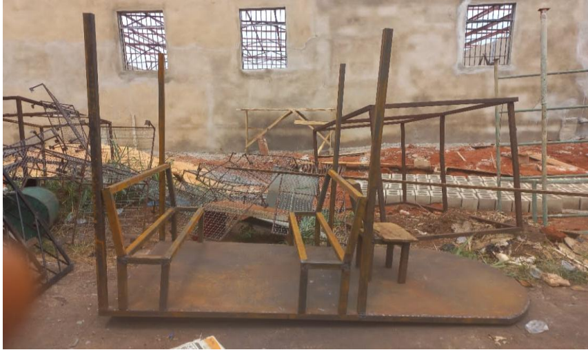
Fig. 2.1: Chassis of the tricycle