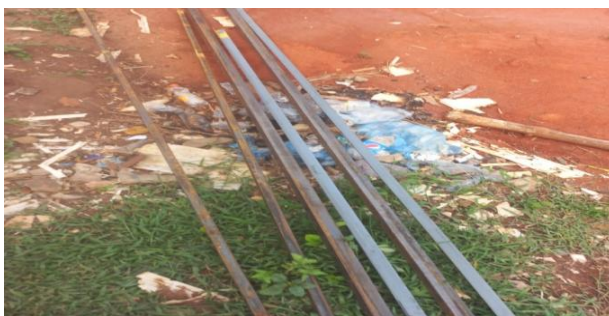
Fig. 3.5: Angle Bars

A structural element composed of metal (usually steel or aluminium) with an L-shaped cross-section is called an angle bar, sometimes referred to as an L-bar or angle iron. Because of its strength, durability, and effective load-supporting capacity, it is frequently utilised in fabrication and construction. The frame construction of this solar-powered tricycle project uses angle bars, which offer a sturdy and lightweight structure to withstand the weight of the motor, battery, rider, and other parts. The L-shaped design improves stability and load distribution by increasing rigidity while maintaining the frame's lightweight. Angle bars also support the solar panel frame during mounting, guaranteeing a solid and movable position for optimal exposure to sunlight.