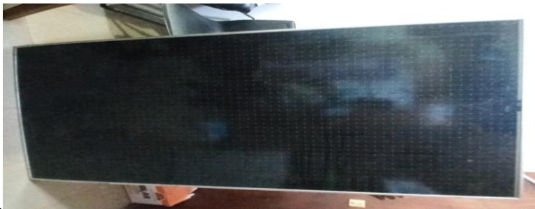
Fig. 3.1: 450W Solar Panel

The system design will determine whether the panels are connected in parallel or series. Series wiring raises the system's voltage, whereas parallel wiring raises the amperage. The particular requirements of the system can also affect the panels' size, voltage, and amperage. All things considered, solar energy is a dependable and sustainable resource that may be applied in a number of contexts.