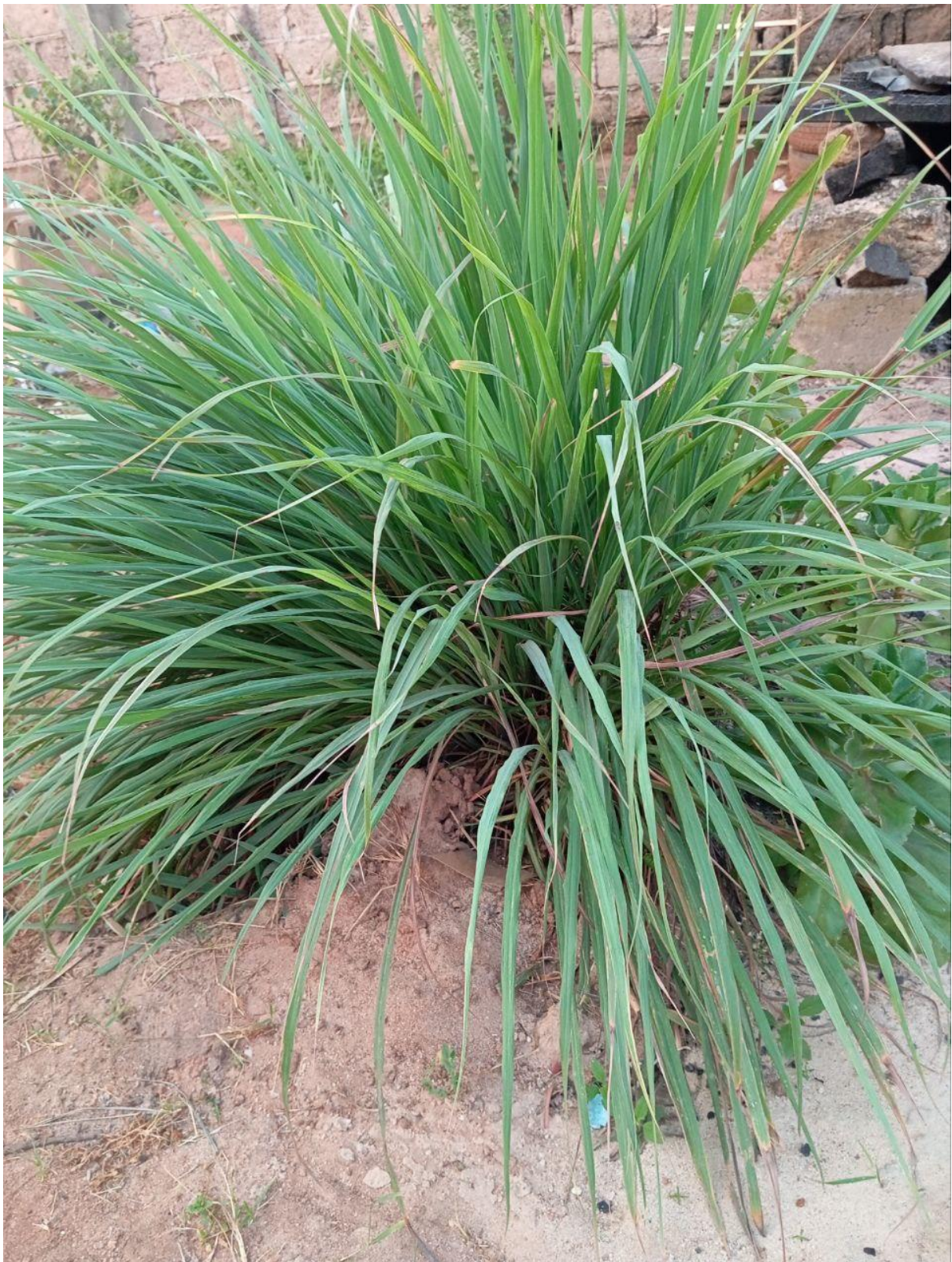
Fig 1. Image of Cymbopogon citratus taken at the Federal Government Girls College Road, Benin city, Nigeria.