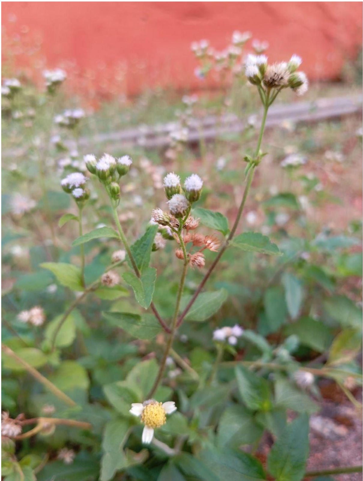
Fig 2. Image of Ageratum conyzoides taken at the Federal Government Girls College Road, Benin city, Nigeria