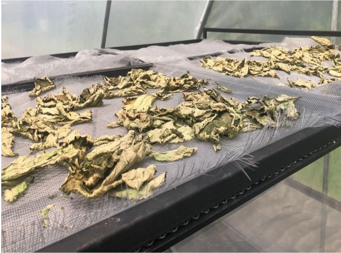
Plate 3: Fluted pumpkin leaves during drying in PSSD