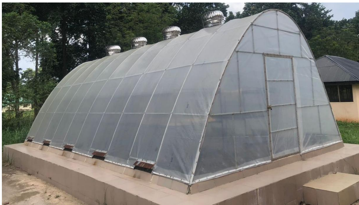
Plate 2: NSPRI Parabolic Shaped Solar Drier at the Department of Food Science and Nutrition, Faculty of Agriculture, University of Benin (UNIBEN).