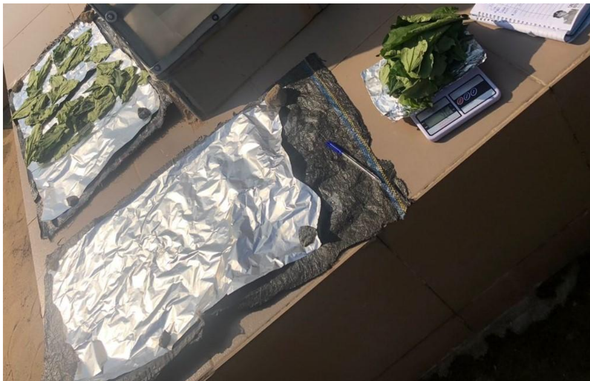
Plate 1: Fluted pumpkin leaves during drying in Open Sun