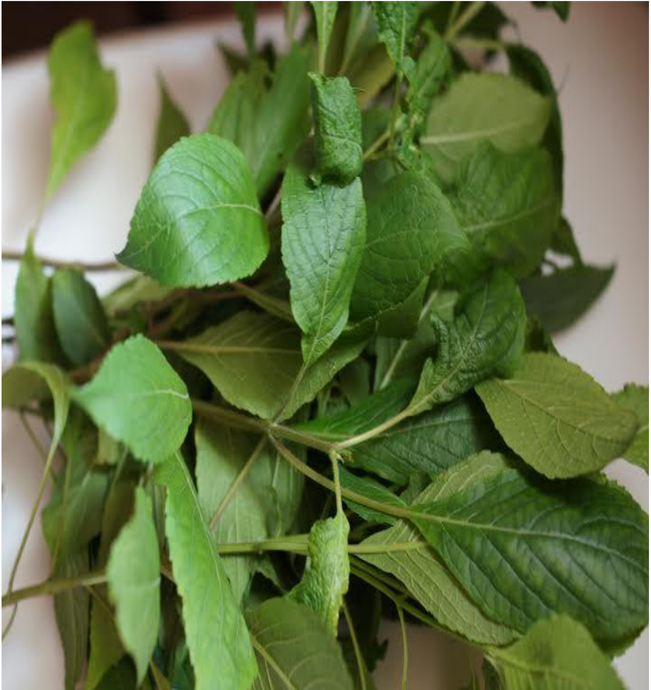
Figure 1: Picture of Ocimum gratissimum leaf