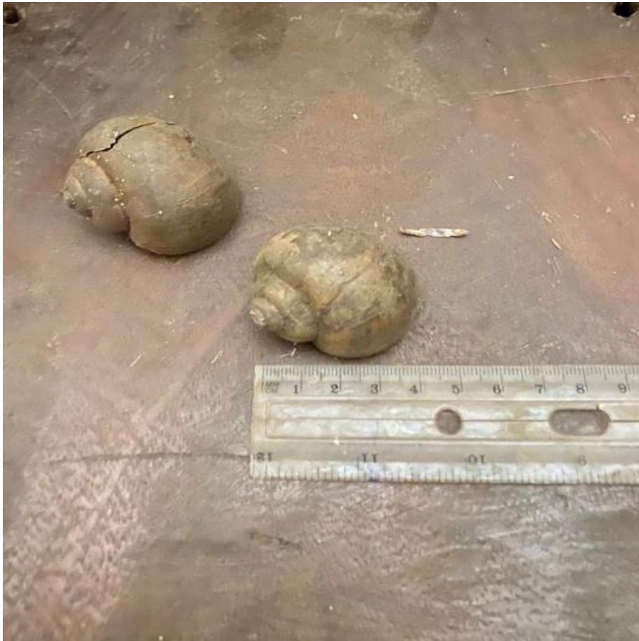
Plate 1: Pilaovata

separated. The cracked snails were placed in a petri dish containing 0.72% normal saline. The muscle, mantle, intestine, reproductive and digestive gland were separated using tweezers, forceps and a dissecting pin.