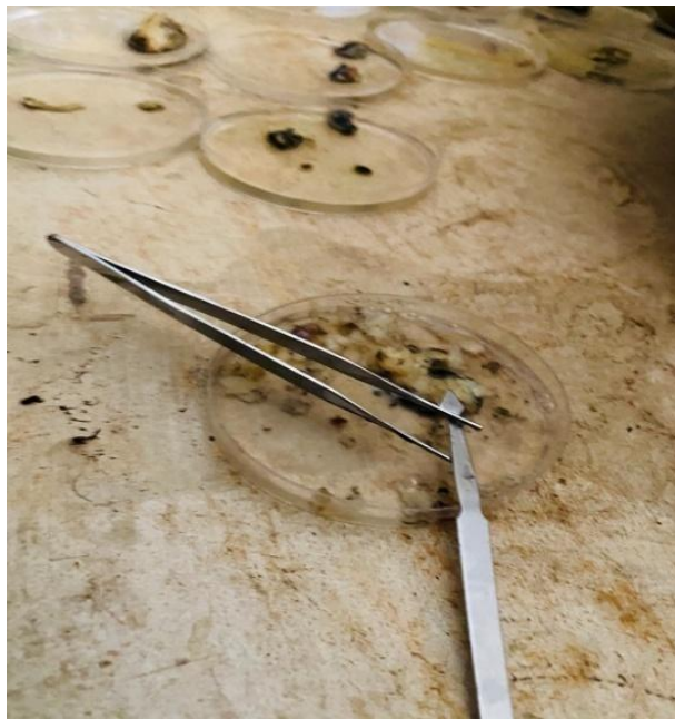
Plate 2: Petri dishes containing teased out tissues of snails