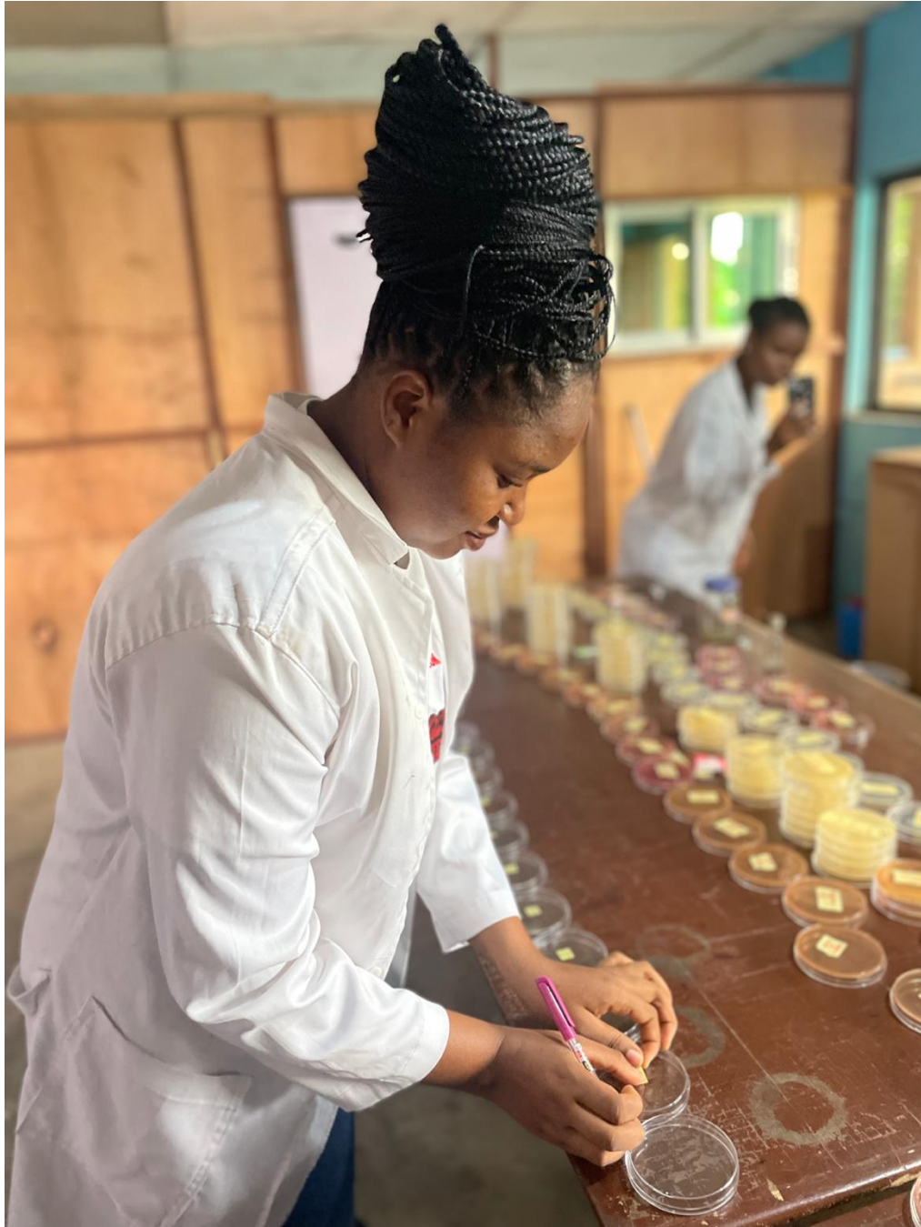
Plate 3: Image of the research work being carried out