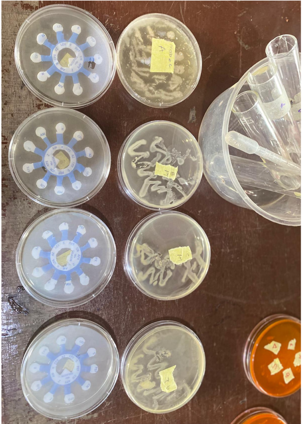
Plate 2: Culture plates