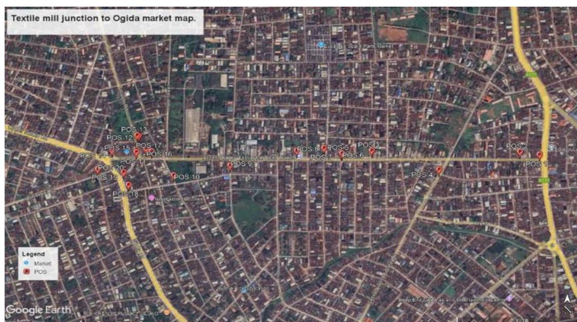
Figure 3.1: A Map Showing the Location at which the research was conducted (Textile mill road to Ogida market, Benin City, Edo state)

This study was conducted along the Textile mill to Ogida market axis in Benin City, Edo State, Nigeria. The area is a densely populated commercial hub characterized by high human traffic, roadside businesses and open markets. POS machines are widely used in these areas as alternatives to banking halls and Automated Teller Machines (ATMs), particularly due to the increasing demand for cashless transactions. The constant handling of POS devices by both operators and customers makes them potential hotspots for microbial contamination.