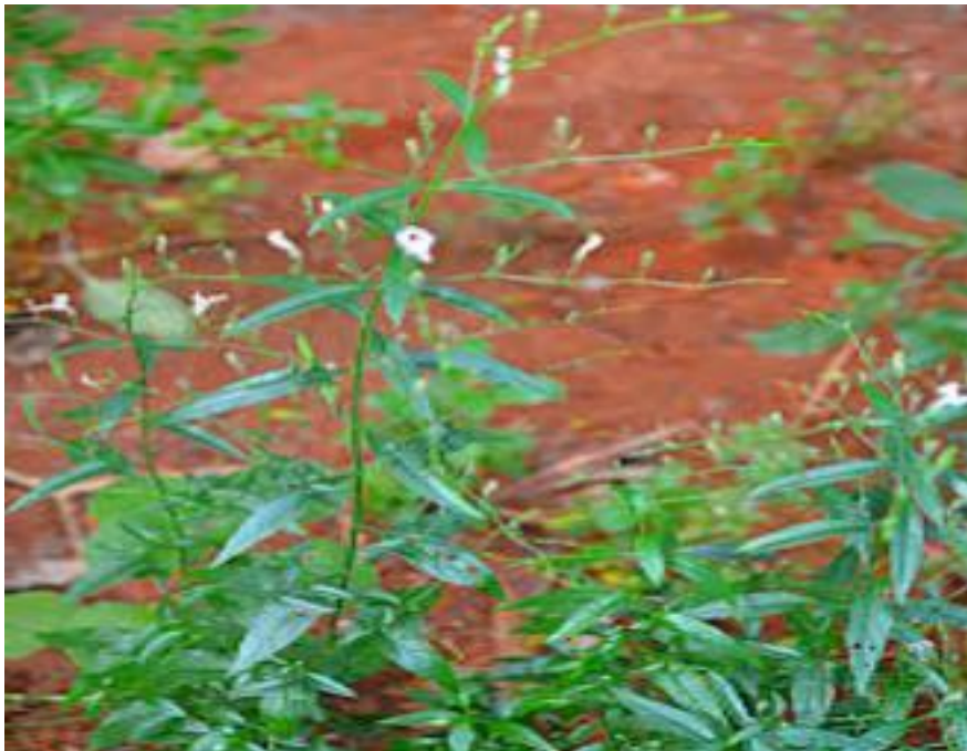
Plate 1: The leaves of Andrographis Paniculata

the winter, the crop is dormant. The amount of the active ingredient andrographolide in leaves is high around the period of flower commencement. Since the entire plant contains active ingredients, the harvested material is dried in the shade before being ground up. In the monsoon season, a well-maintained crop yields 3.5 to 4 tonnes/ha of herb (Chauhan and Gyanendra, 2003; Maheshwar et al , 2002; Seema et al. , 2003).