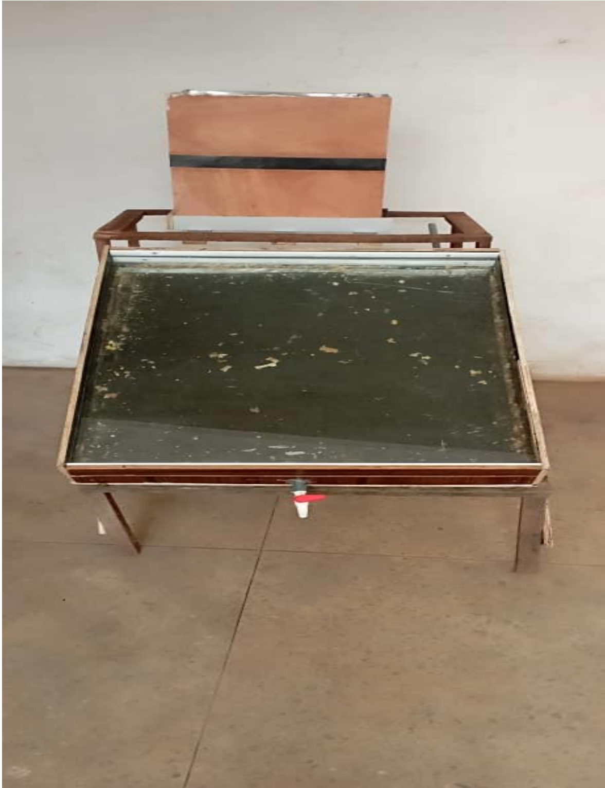
Solar water heater after fabrication